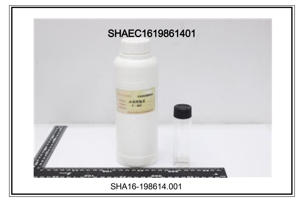
SGS authenticate the photo on original report only